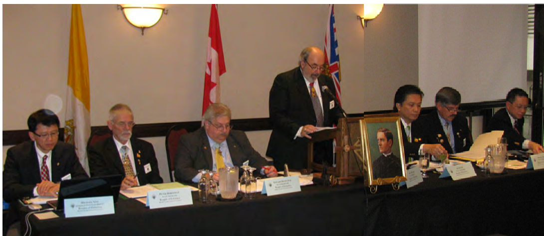
STATE EXECUTIVE OFFICERS at State Council Mid Year Meeting held at Sheraton Vancouver Airport Hotel November 30-December 1, 2012. In attendance were State Directors and Chairmen plus the District Deputies of the 29 Districts of British Columbia and Yukon State Council.