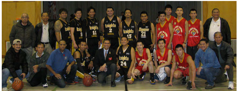
St. Joseph Parish Council 10681 Team Champion and 2 nd Place Winner Canadian Martyrs Council 11916