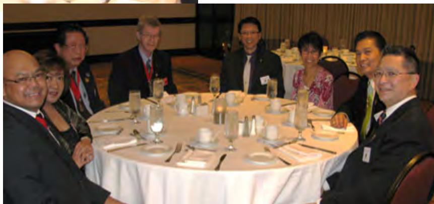
British Columbia and Yukon State Council Officers, Directors, Chairmen and District Deputies.