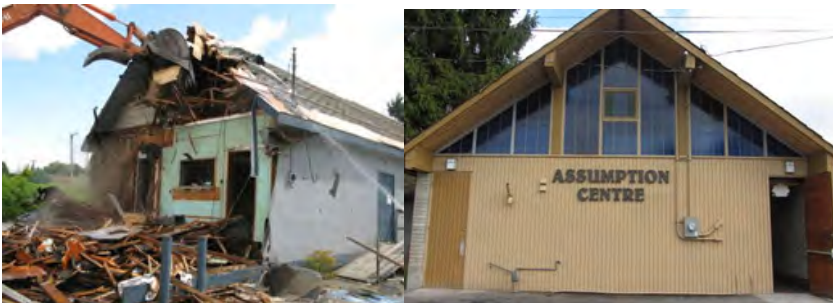
BEFORE.....and ..... AFTER

Council 9125—District 7 Port Coquitlam Council Port Coquitlam, B.C. Grand Knight: Priscilo(Loy)Tetangco