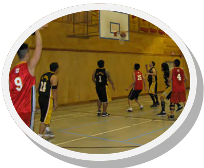
Archbishop Duke Council 6855 3 rd Place Winner and 4 th Placer St. Monica Council 12861