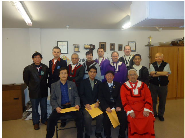
First Degree January 20 2013