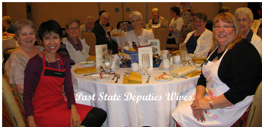
Past State Deputies Wives