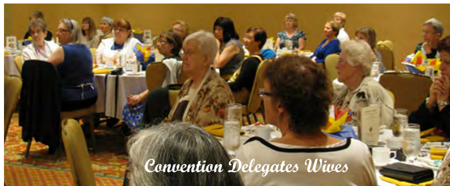
Convention Delegates Wives