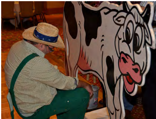
State Deputy Wil Wilmot