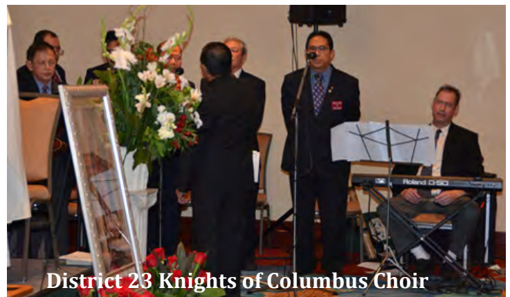
District 23 Knights of Columbus Choir