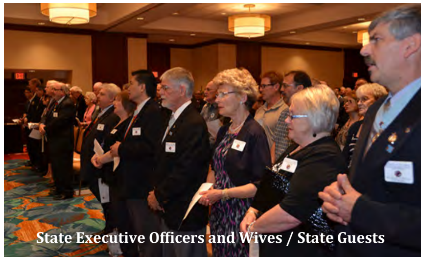
State Executive Officers and Wives / State Guests