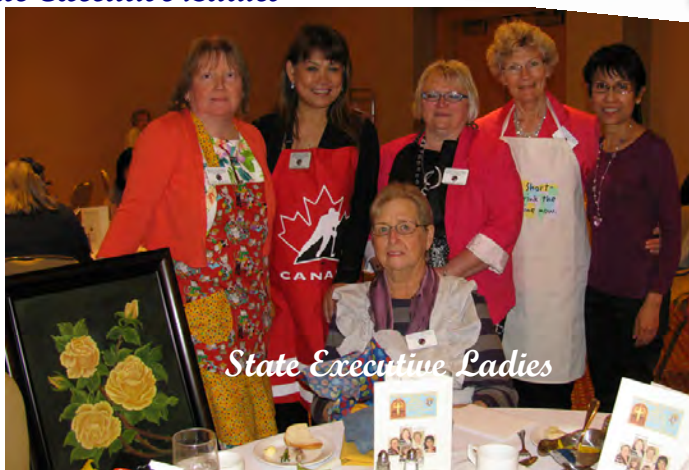
State Executive Ladies