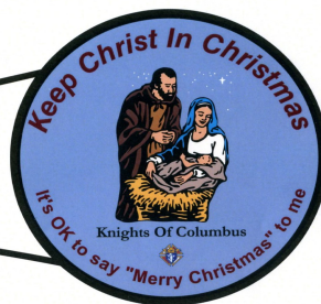
Knights Of Columbus Council Number 7015